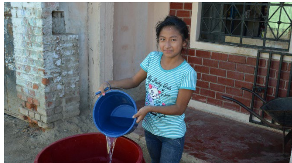
(One of many children impacted by VAVV's donors and prayers. She will soon be receiving clean water in her village)