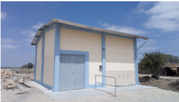
(VAVV's donors helped fund this building which will house the water treatment facility in Monte Castillo, Peru)

Because of the generosity of our donors, Vera Aqua Vera Vita has enough funds to begin Phase II of the work in Monte Castillo which includes Comprehensive Wastewater Infrastructure Improvements and implementing our Education Curriculum .